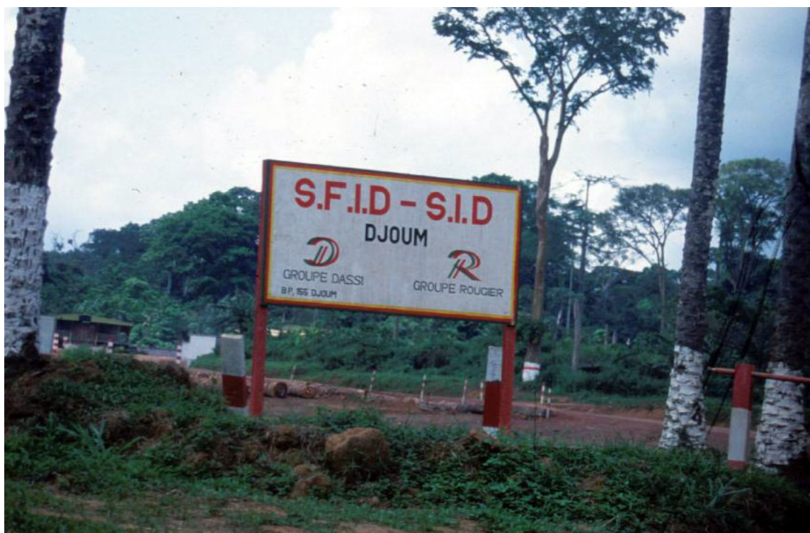
Photograph: Sign at entry to sawmill